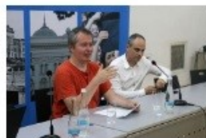
"European Dimensions of the Medieval Georgian School of Philosophy"

On 22 September, 2019 the seminar - "The Multiplicity of Literary Forms" was held by the Academia Europaea Tbilisi Knowledge Hub and the Center for Eastern Christian Studies under the DSS at Tbilisi State University.