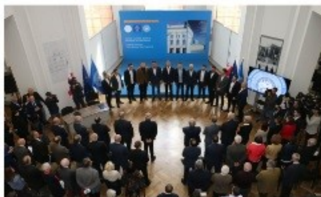
Tbilisi State University

The Tbilisi Regional Hub of Academia Europaea was inaugurated at the Aula of Tbilisi State University on the 24th of April, 2019. The President of Georgia Salome Zurbashvili has welcomed the opening of the Hub and the inauguration ceremony was attended by the Prime Minister of Georgia Mamuka Bakhtadze, Parliamentarians, the Diplomatic Corps, members of the Board of Trustees of Academia Europaea, professors and students of Tbilisi State University.