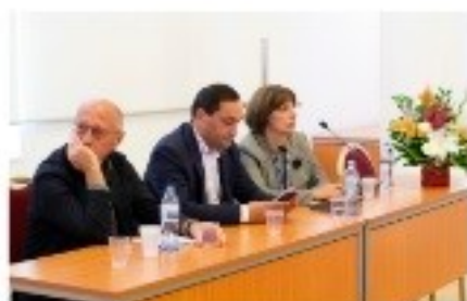
"Microbial Culture as Part of Human Culture"

The Tbilisi Knowledge Hub has launched the Distinguished Seminar Series - THE CROSSROADS, featuring presentations by outstanding thinkers and scientists. The purpose of the seminars is to popularize science, to encourage the exchange of ideas at crossroads - across the barriers of disciplines, time, and space, and to promote interdisciplinary, international scientific cooperation. Distinguished speakers are selected based on the impact of their research on the scientific community. In 2019 three seminars of the series have been organized.