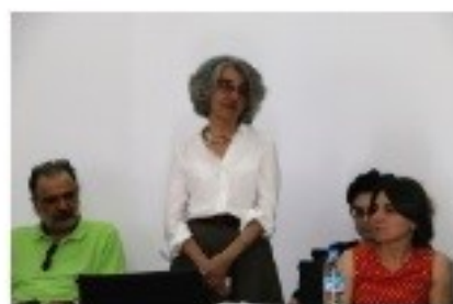
"The Multiplicity of Literary Forms"