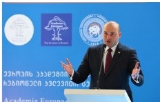
Prime Minister of Georgia, Mamuka Bakhtadze